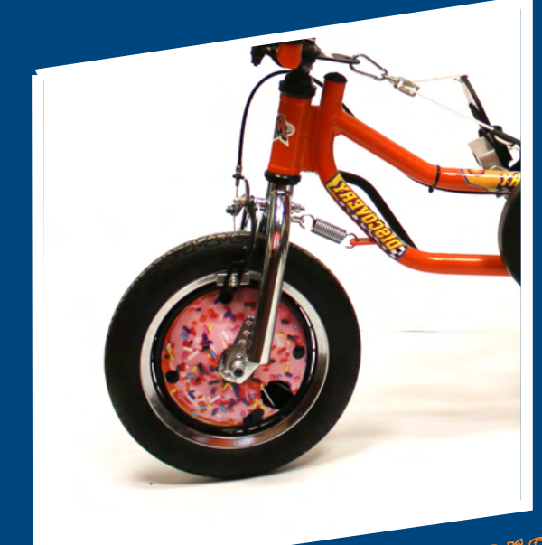
Custom Spoke Covers