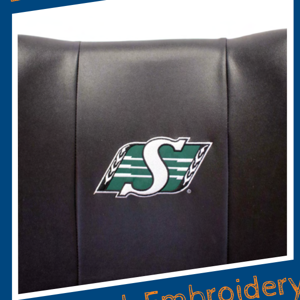
Seat Back Embroidery